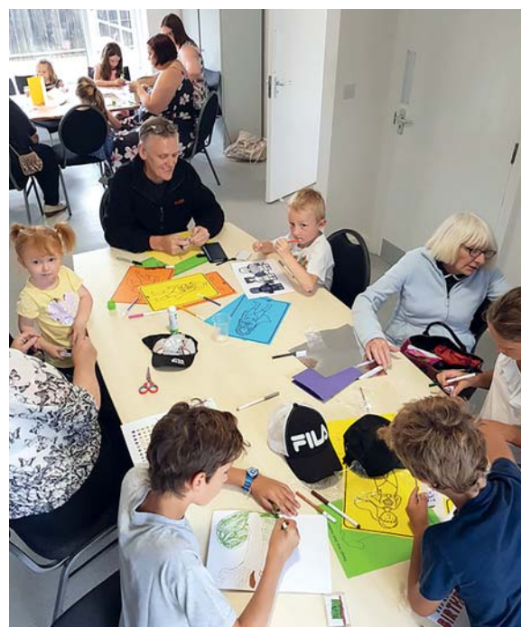
Arts and crafts in the annexe