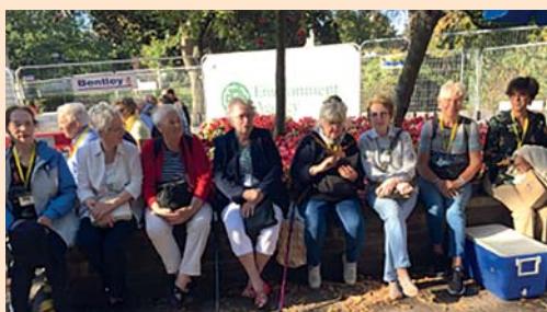
A day at York some members from both clubs. Helsingborg & Cleveland