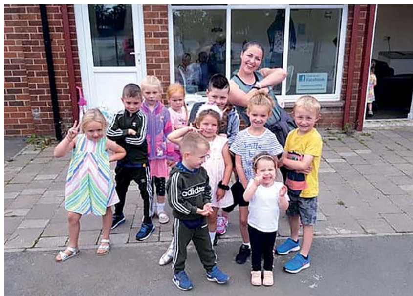
Cool Dudes street dance