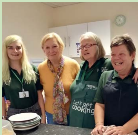
4 volunteers in Billingham