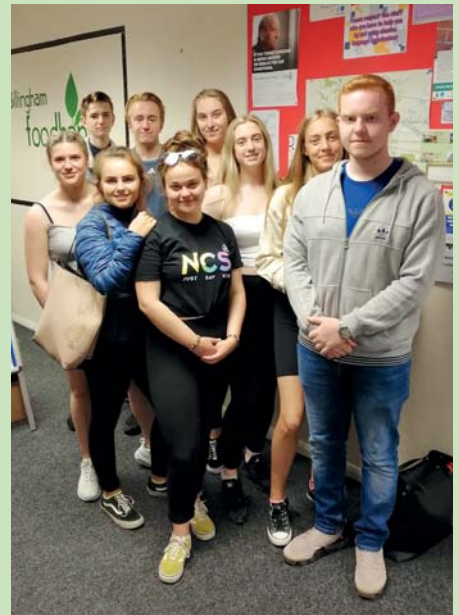
NCS team helping during the summer

Thank you to all who contribute to helping others through the foodbank.