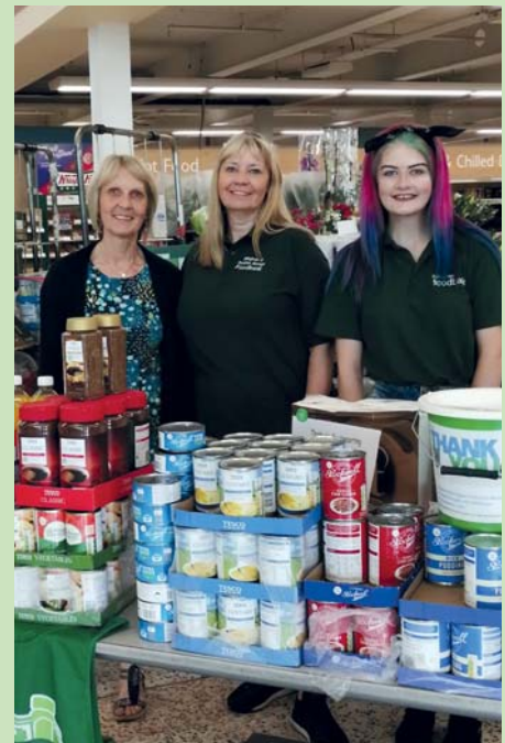
Collecting food in Tesco